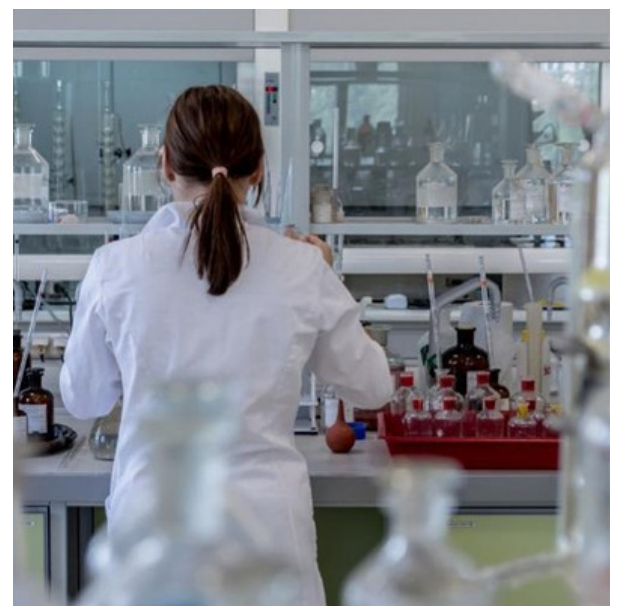
We're working with labs at EPA and the University of Washington.

We are continuing to partner with the University of Washington Center for Urban waters to develop a way to look for chemicals in the water (like caffeine or veterinary drugs) that might give us an idea of where pollution is