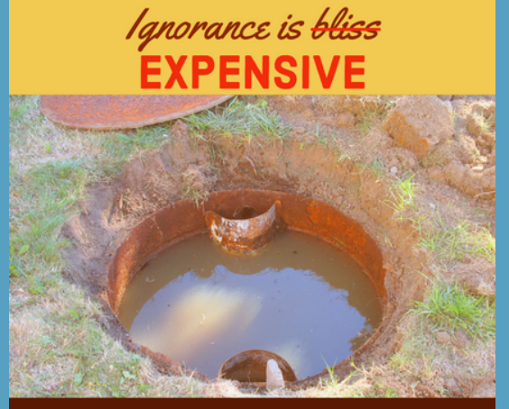
WHEN WAS THE LAST TIME YOU GOT YOUR SEPTIC SYSTEM INSPECTED?

You can find all our best maintenance tips (and a few groan-worthy puns) at poopsmart.org/septic.